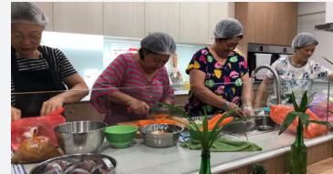
Table with Neighbours 一起同桌

Offers communal dining for vulnerable seniors to reduce isolation and encourage healthy eating through bonding, activities, and planned meals. 为弱势年长者提供社区聚餐, 透过建立社交关系和膳食, 以鼓励健康饮食和减少孤立。