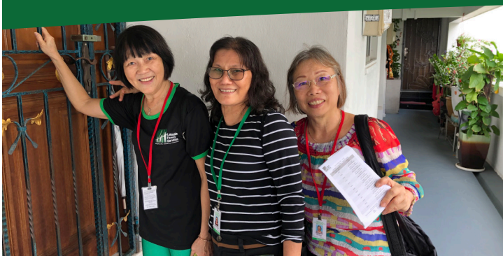
Community Outreach 社区外展