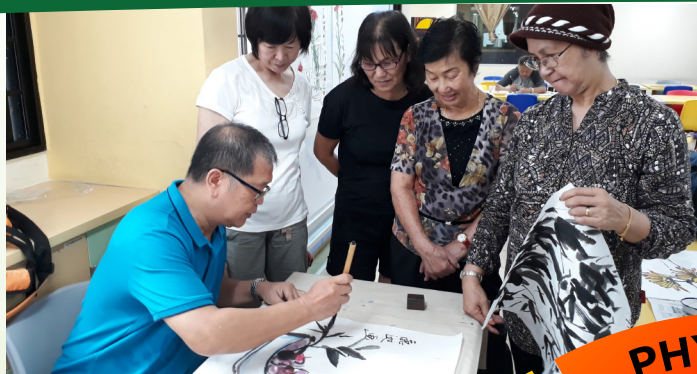
Chinese Painting 国画