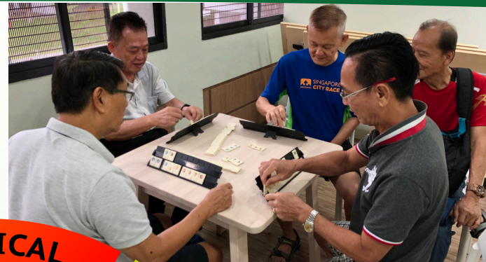
Good Men's Group 好男人小组