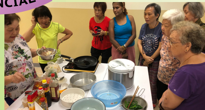
Cooking Demonstrations 烹饪示范